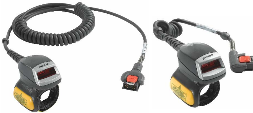
RS419-HP2000FLR Ring scanner for WT41 hip mounted.