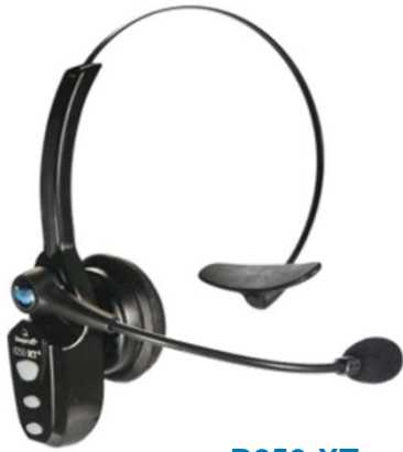
B250-XT+ Bluetooth Headset for WT41N0