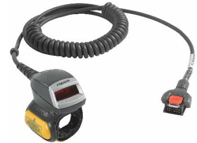
RS419-HP2000FLR Ring scanner with cable to waist