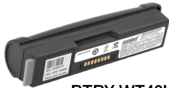
BTRY-WT40IAB0E Standard Lithium Ion battery, 2330 mAh