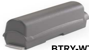
BTRY-WT40IAB0H Extended Lithium Ion battery, 4600 mAh