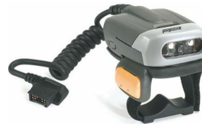
RS507-IM20000CTWR Corded imager with trigger