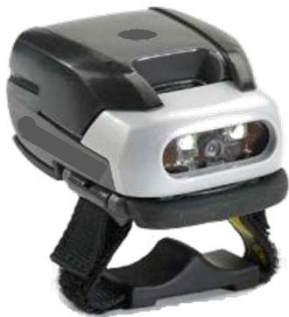
RS507-IM20000ENWR Imager without trigger and extended battery