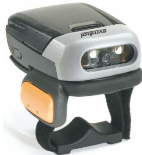
RS507-IM20000STWR Imager with trigger and standard battery