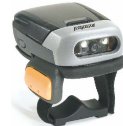
RS507-IM20000STWR Imager with trigger and standard capacity battery