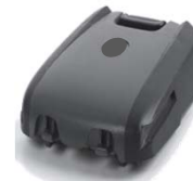
KTBTYRS50EAB00-01 Standard Lithium Ion battery, 970 mAh