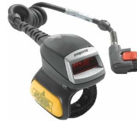
RS419-HP2000FSR Ring scanner with cable to wrist

RS419-HP2000FLR Ring scanner, to be used with the WT41N0 worn on the hip.