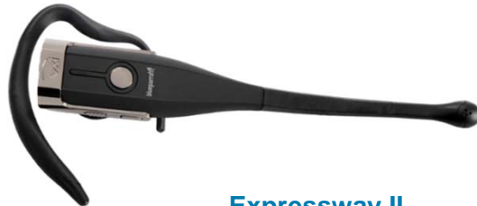
Expressway II Bluetooth Headset for WT41N0