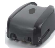
KTBTYRS50EAB02-01 Extended Lithium Ion battery, 1940 mAh